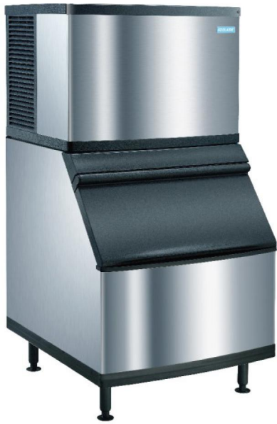
ES-460 Ice Machine on E-400 Bin