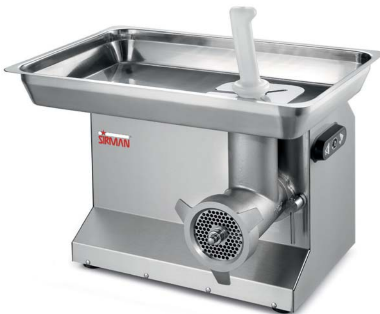
TC 32 COLORADO