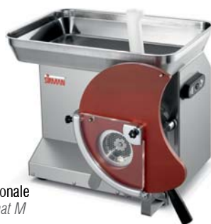
Format M opzionale Optional Format M