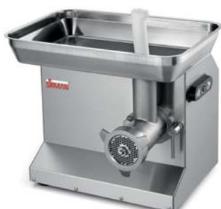
TC 22 COLORADO