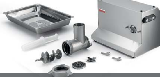
TC 22 COLORADO con hamburgatrice