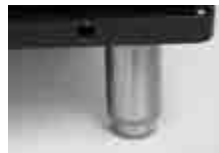
Adjustable legs (from 101-152mm) available with optional leg kit K-00345.